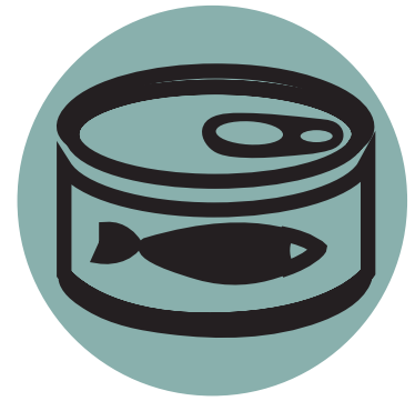
Aluminium tins & cans