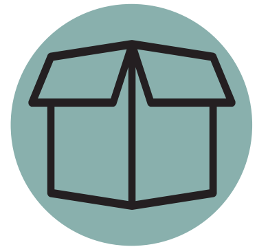
White paper & cardboard